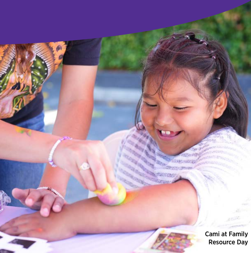
Cami at Family Resource Day